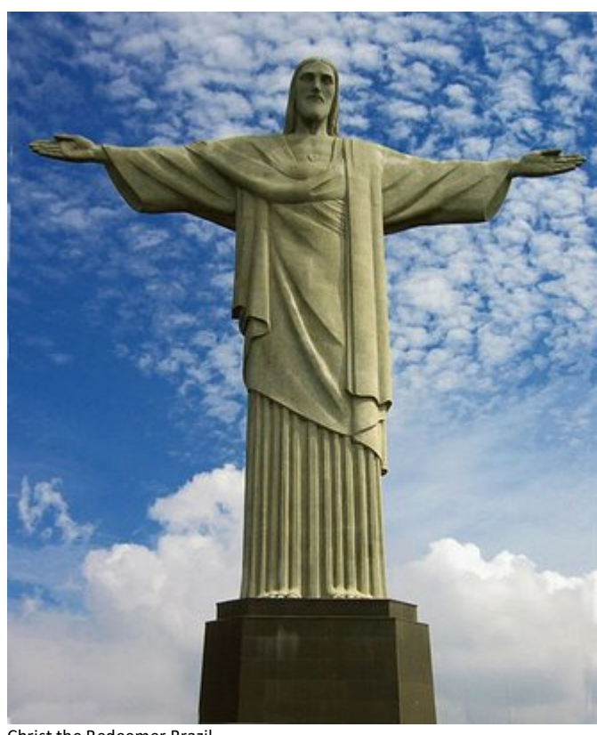
Christ the Redeemer Brazil.